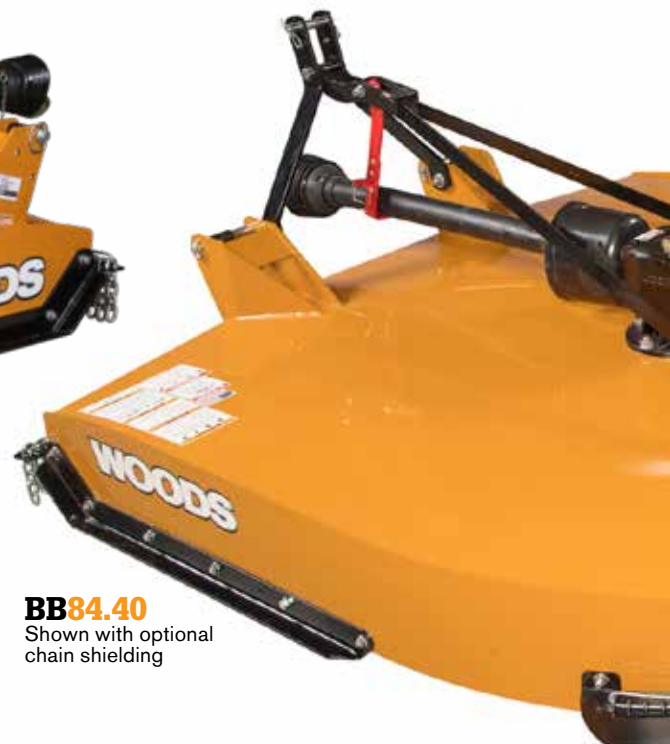
BB84.40 Shown with optional chain shielding