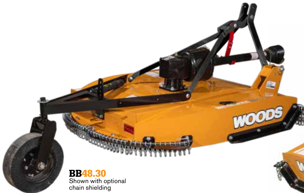
BB48.30 Shown with optional chain shielding