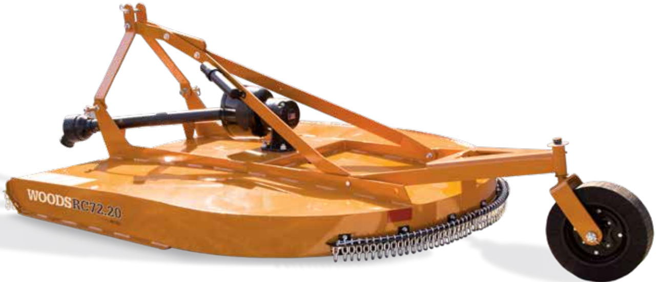
RC72.20 shown with optional chain shielding

Woods' RC-Series Single-spindle is ideal for getting the most from your compact or subcompact tractor. Built with high-strength steel, Woods confidently stands behind this product with our three-year gearbox warranty.